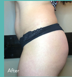
Hermann Pirela, MD

"BodyFX is really unique and stands alone as an excellent way to treat stubborn body fat areas with little to no pain or side effects."